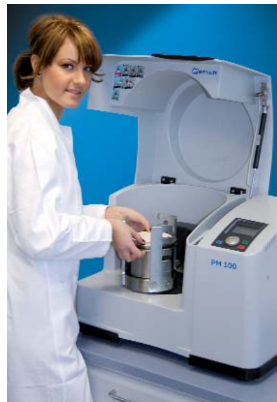
Figure 1. Planetary Ball Mill PM 100.

in classic laboratory synthesis). However, the synthesis conditions such as pressure, temperature, degree of size reduction and particle size distribution can only be controlled in a limited way.